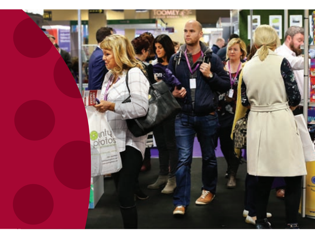
EXHIBIT PROMOTE SPONSOR

Ireland's largest education trade event a unique opportunity to meet nationwide customers in one location